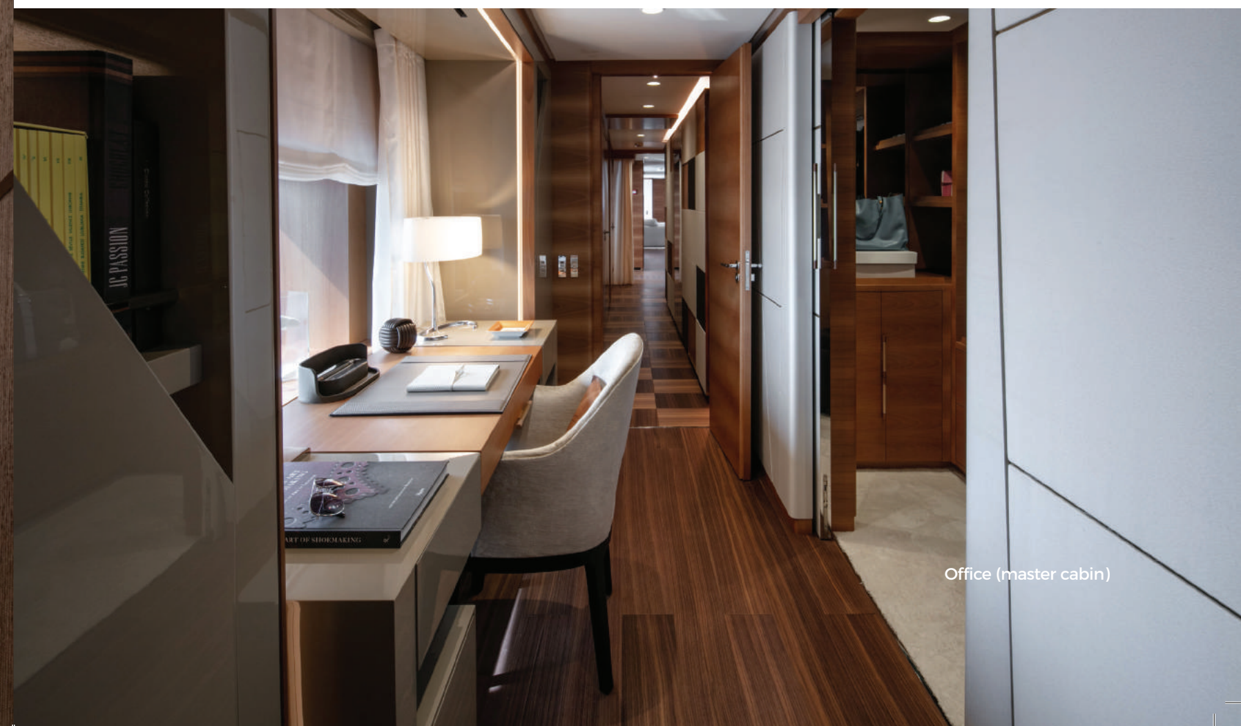
Office (master cabin)